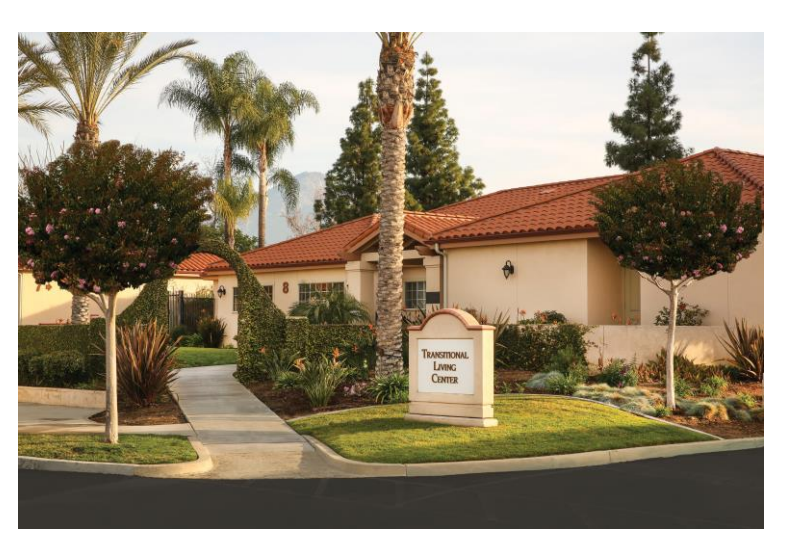
*Based on 2023 discharges