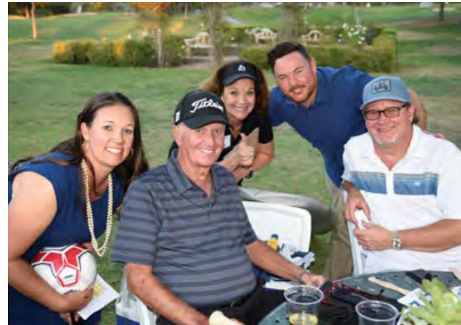
When you give to Casa Colina, you can be sure we will maximize your gift to achieve the greatest impact. It's our promise to you and to our patients and their families.

From estate planning and direct donations to in-kind gifts and employee contributions, our dynamic donor network has a remarkable impact on patient outcomes. And of course we can't forget our intrepid volunteer corps. Last year, 519 total volunteers gave 30,026 hours in support of our programs and services, from meal delivery to event staffing and much more.